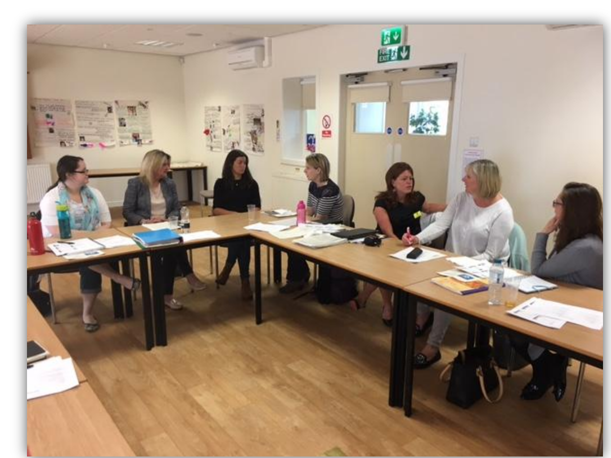
Cohort 1 - Focus Group

The six NHSGGC hospices and NHSGGC Hospital Palliative Care Teams (HPCTs) were invited to nominate Palliative Care Band 6 Clinical Nurse Specialists to join the Programme.