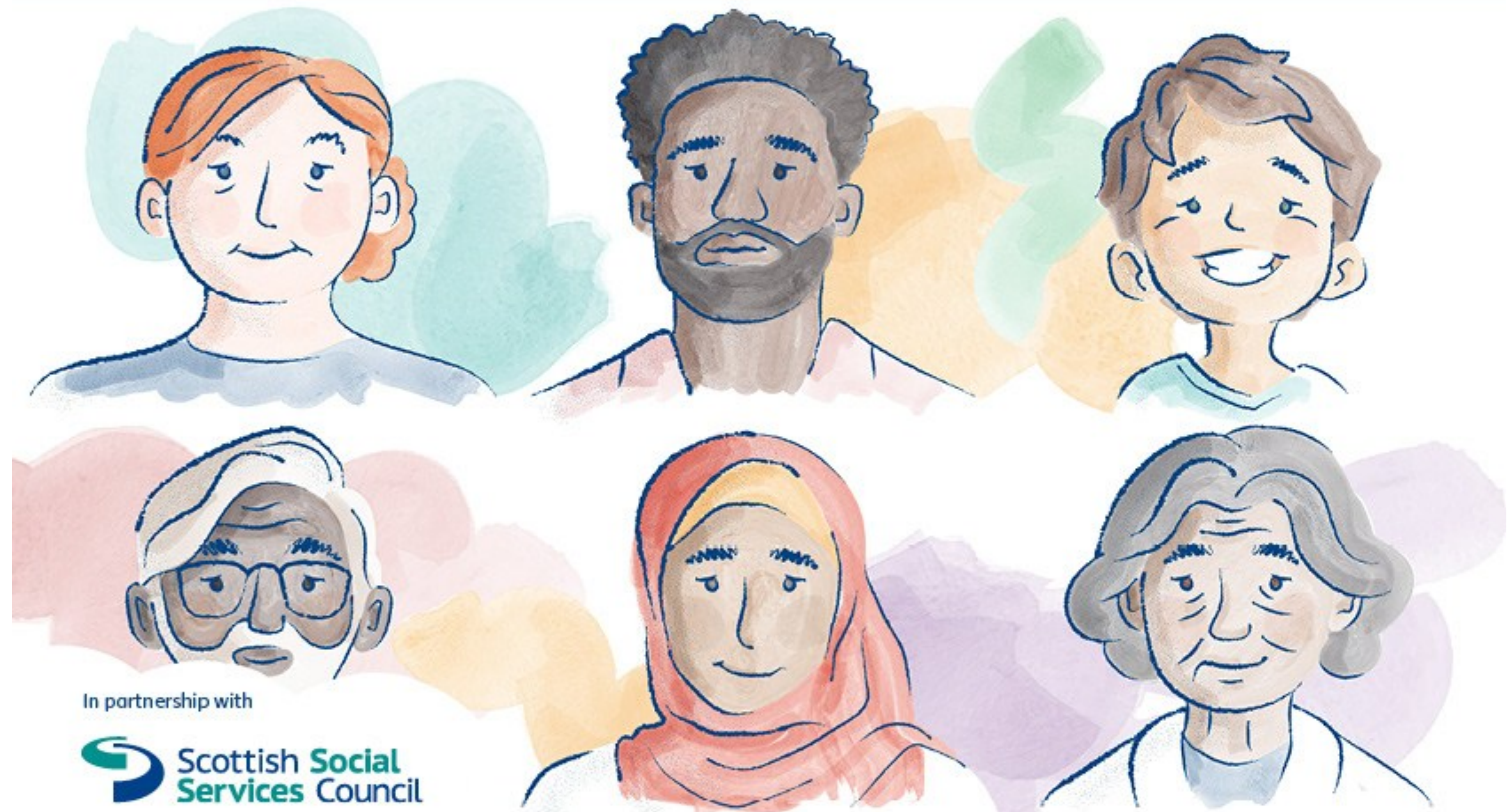
Above: Front cover. Palliative Care Education Framework (NES / SSSC, 2025).