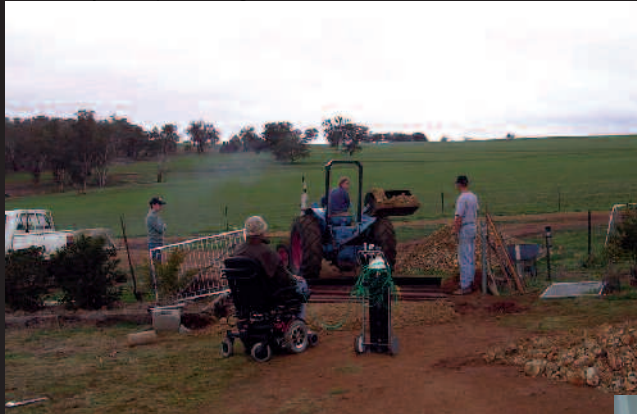
A PALLIATIVE CARE PATIENT FROM HOSPICE IN AUSTRALIA SUPERVISES HIS CHILDREN AS THEY TAKE OVER THE FARM