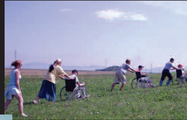
HOSPICE VOLUNTEERS AT CASA SPERANTEI, ROMANIA, TAKING THREE BROTHERS ON AN OUTING