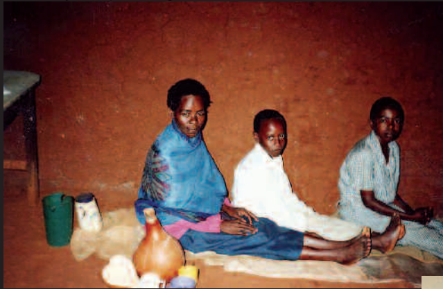
A PATIENT OF THE WOMEN'S GUILD PALLIATIVE CARE PROGRAMME OF CHOGORIA HOSPITAL, KENYA, WITH HER CHILDREN