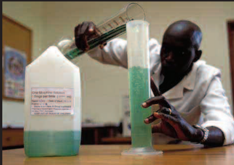
A VOLUNTEER PREPARING MORPHINE AT HOSPICE AFRICA, UGANDA

OPIOIDS ALONE ARE NOT THE SOLUTION TO THE WIDER AVAILABILITY OF PALLIATIVE CARE, BUT THEY ARE A MARKER OF PROGRESS. THEY ARE SIMPLE, CHEAP, SAFE AND EFFECTIVE.