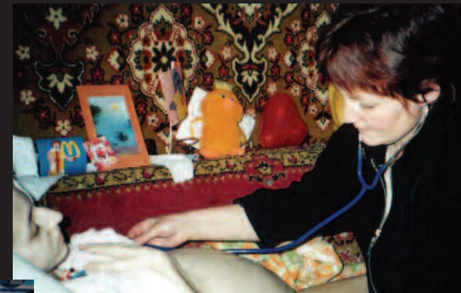
PALLIATIVE CARE AT HOME IN BELARUS