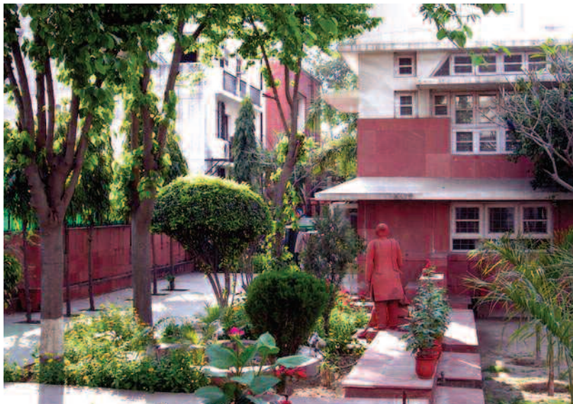
THE GARDENS AT SHANTI AVEDNA SADAN, DELHI

Go round and see what is being done and then see how your own circumstances can produce another version; there is need for diversity in this field.