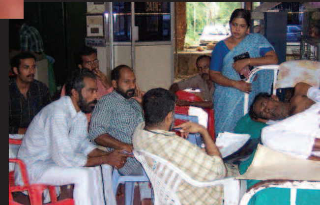
A PATIENT IN KERALA WITH HIS FAMILY WHO PLAY A KEY ROLE IN DECISIONS ABOUT MANAGING HIS CONDITION