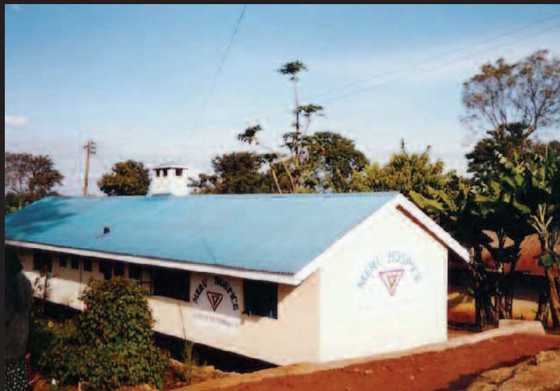
MERU HOSPICE, KENYA

IT IS ESTIMATED THAT HOSPICE OR PALLIATIVE CARE SERVICES NOW EXIST, OR ARE UNDER DEVELOPMENT, ON EVERY CONTINENT, IN AROUND 100 COUNTRIES.