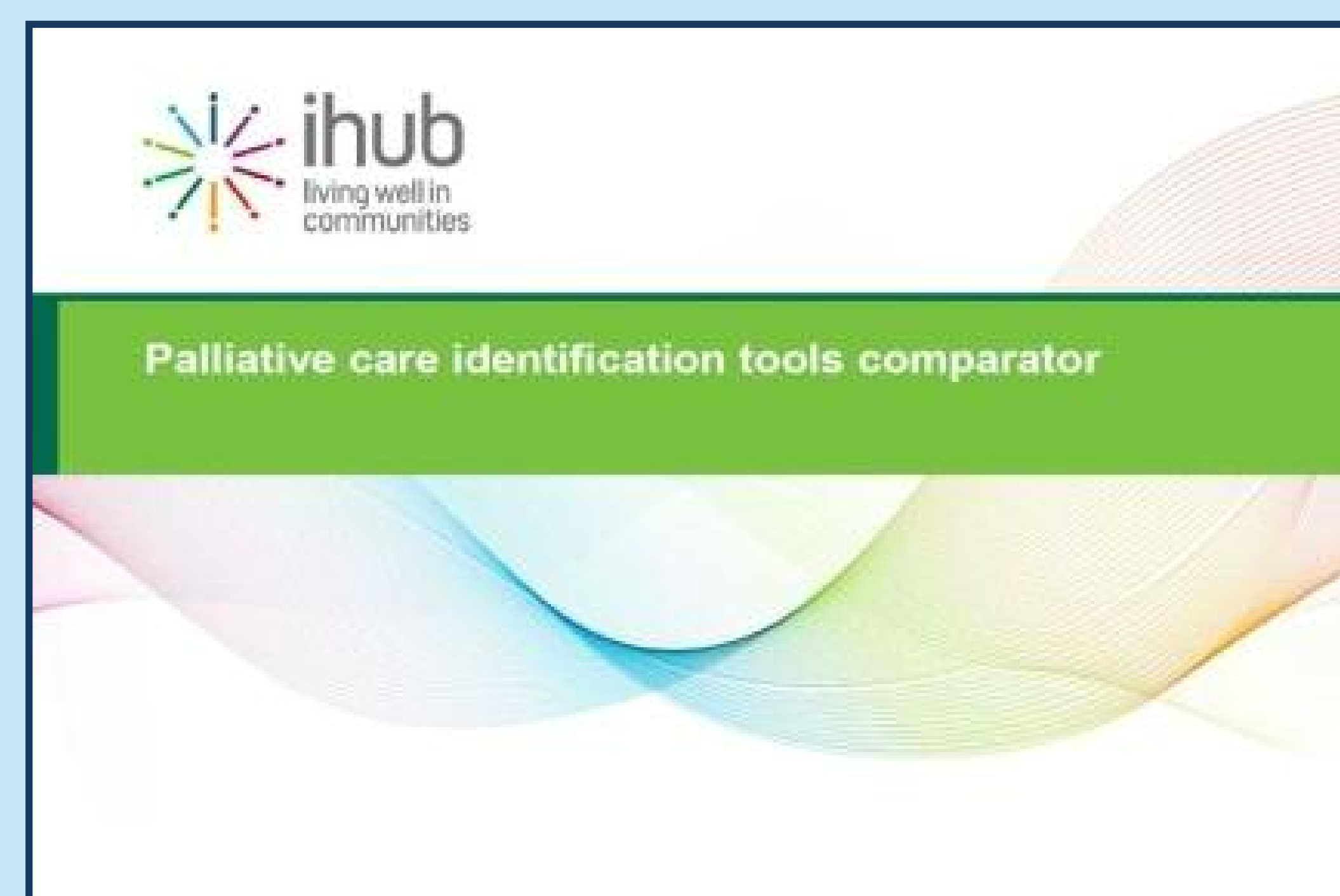
Use of early Identification tools