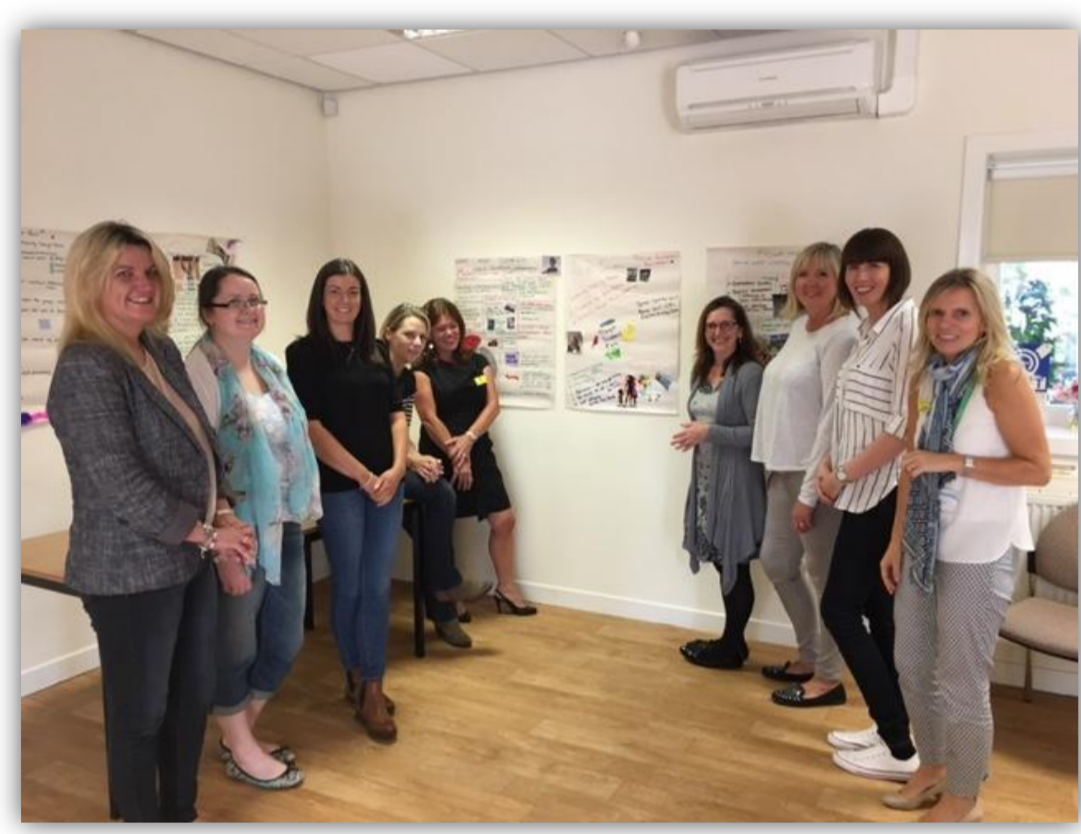
Cohort 1 - Focus Group Participants