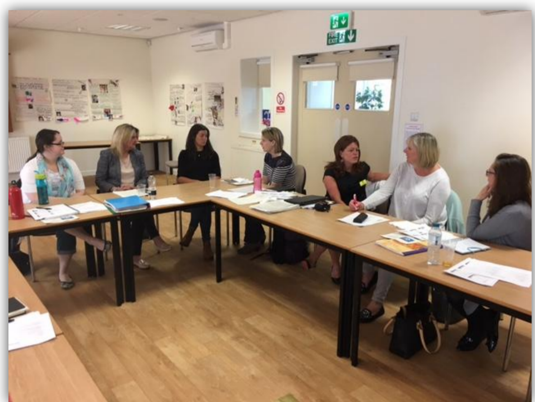
Cohort 1 - Focus Group